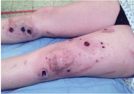
Wicksteed Park 2005